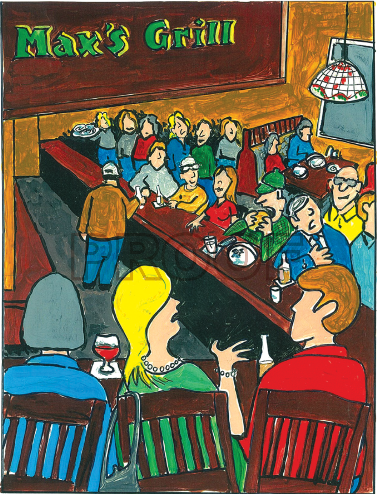
Max's Grill Menu Cover