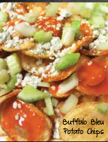
Buffalo Bleu Potato Chips