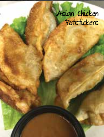
Asian Chicken Potstickers